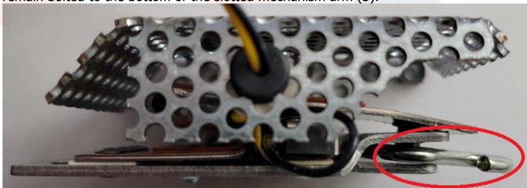
Figure 2: McCabe Link S-Hook Reset Detail